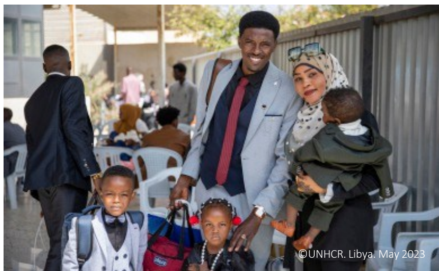
Libya. May 2023

To contribute to upholding safety and dignity and to prevent and alleviate the suffering of vulnerable migrants (including victims of trafficking and children at risk) in Ejdabya, a region with varying degrees of humanitarian, health, protection, and psychosocial needs, IOM Libya has established a multi-service community center (MRRM base) and a MRRM mobile team in charge of providing a wide range of direct assistance services including food and NFIs distribution, health and medical assistance, Mental Health and Psychosocial Support (MHPSS), protection services and referrals to vulnerable migrants as well as raising awareness on the risks of irregular migration, regular migration pathways, and availability of other services accessible to migrants. Furthermore, the MRRM team implements community-based projects encouraging social cohesion among migrants, host communities, and other groups within the community. The project also foresees workshops and trainings for local authorities and key stakeholders on migration-related topics to build their capacity on migration governance