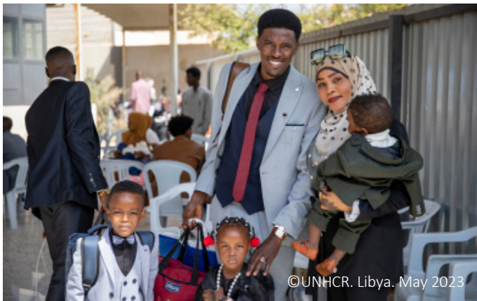
Libya. May 2023